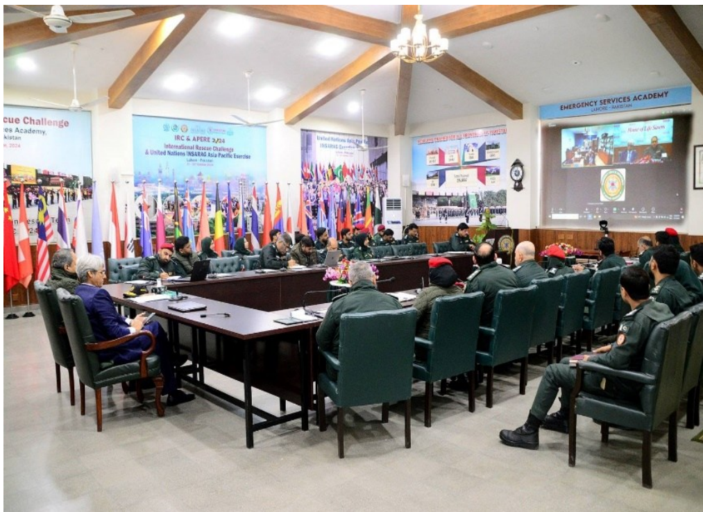
Participants from the training of Rescue Officers on Research Methods.

The training was attended and the officers of participated by Punjab Emergency Services Department.