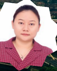
The Participants of the 2 nd Batch of the International Fellowship Program